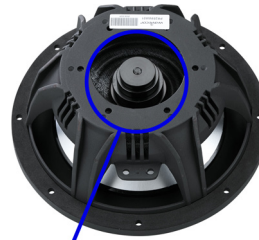
Three exchangeable weights for custom tuning