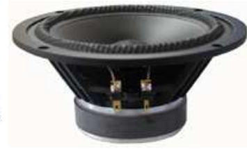
6.5" PPM. WOOFER