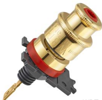
WBT-0705 Cu RoHS compliant